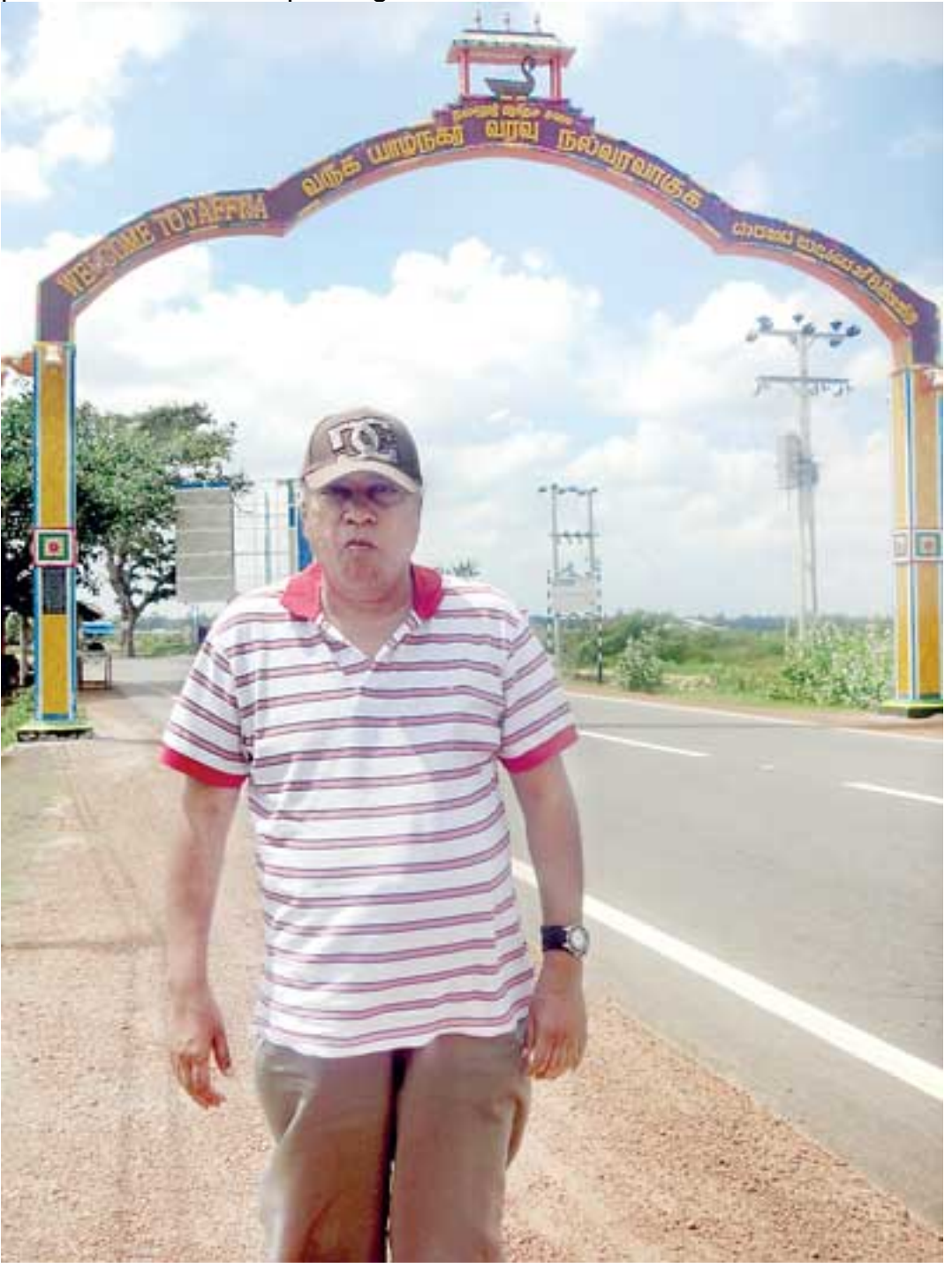
was intruding. There were feelings of guilt too at deserting my land and my

Kilinochchi and finally to Vavuniya. Going up north to Jaffna was quite traumatic in some respects. Many thoughts were troubling me as our vehicle progressed along the A-9 Highway or Jaffna-Kandy road. In those days there were rows of trees on both sides of the road. Now they are missing, presumably cut down due to security reasons. For some reason I was feeling rather uneasy as our van proceeded. After the prolonged absence, I felt like an outsider who